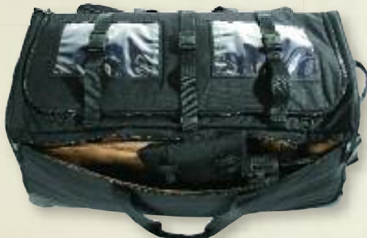
Three 8"x10" clear window pockets on exterior for manifesting, content inventory, or identification