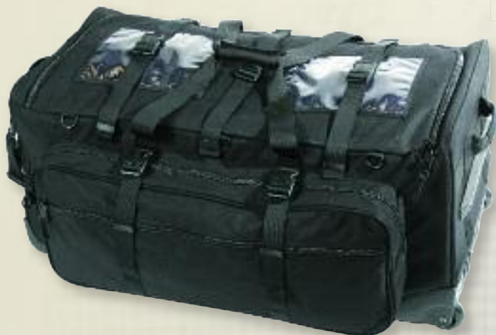
Large exterior compartment 29"x11" with exterior zippered pocket and internal clear organizer pouch and mesh pocket