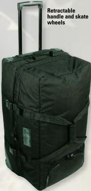
Retractable handle and skate wheels