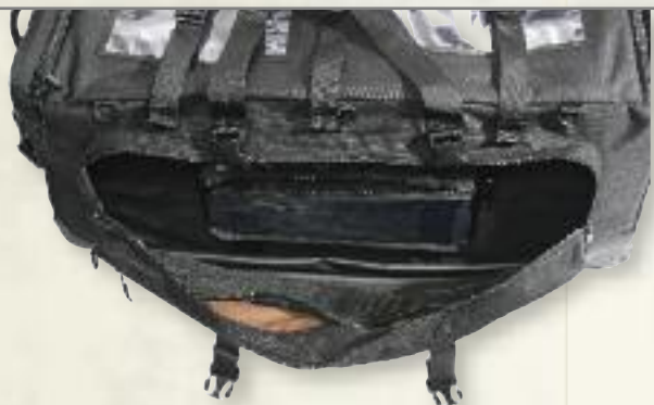
Large weapon sleeve on opposite side; 33" x 14" with heavy padding to protect long guns